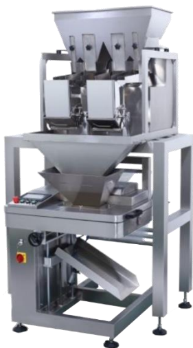
With Multihead Weigher